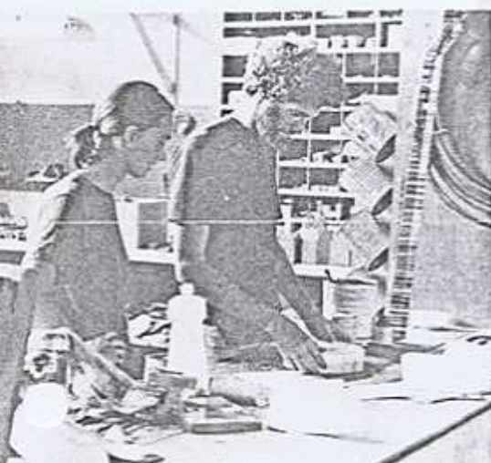
The summer has seen an increase in arts and crafts work, by members of the community, the Sisters of St. Mary of Namur, and other guests of the monastery. Pictures here show BR.