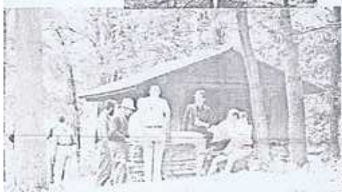
The spring outing, held in June, near Ithaca.