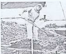
Tree planting in the spring.