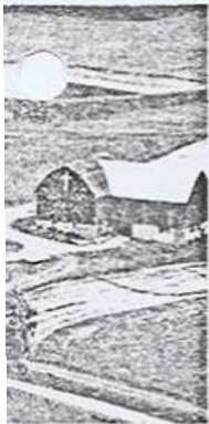
h of Elmira Star-Gazette

dy on his desk an auto- In the course of their at hope in the Church