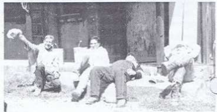
A portion of our former clowning crew now our cloning committee. They are better left unidentified.

msaviour@servtech.com http://www.servtech.com/public/msaviour