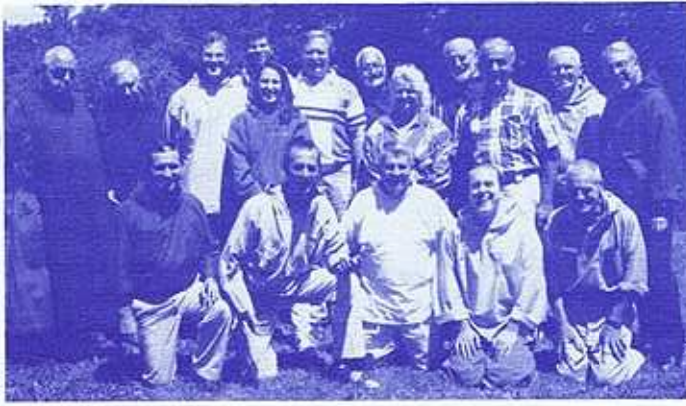
1994 Summer Program participants and staff.