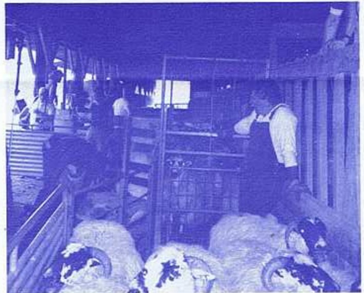
Chuck Campbell and helpers at shearing time.