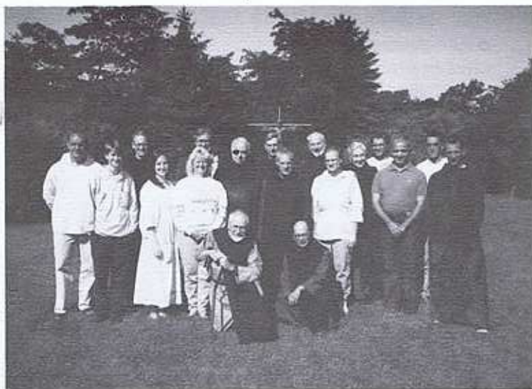
The brothers, summer retreat group and staff, 1992.