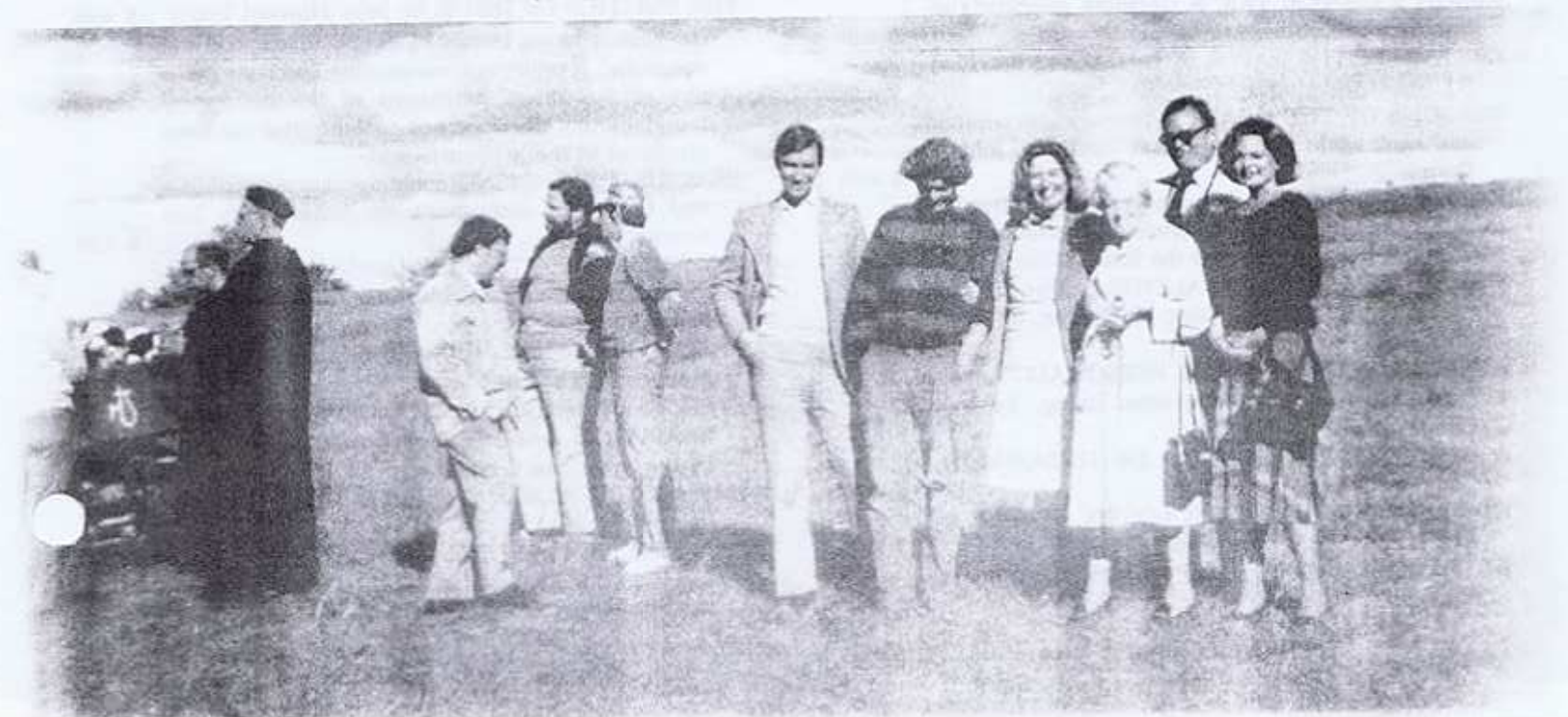
A group of oblates at the Monastery, on October 1981