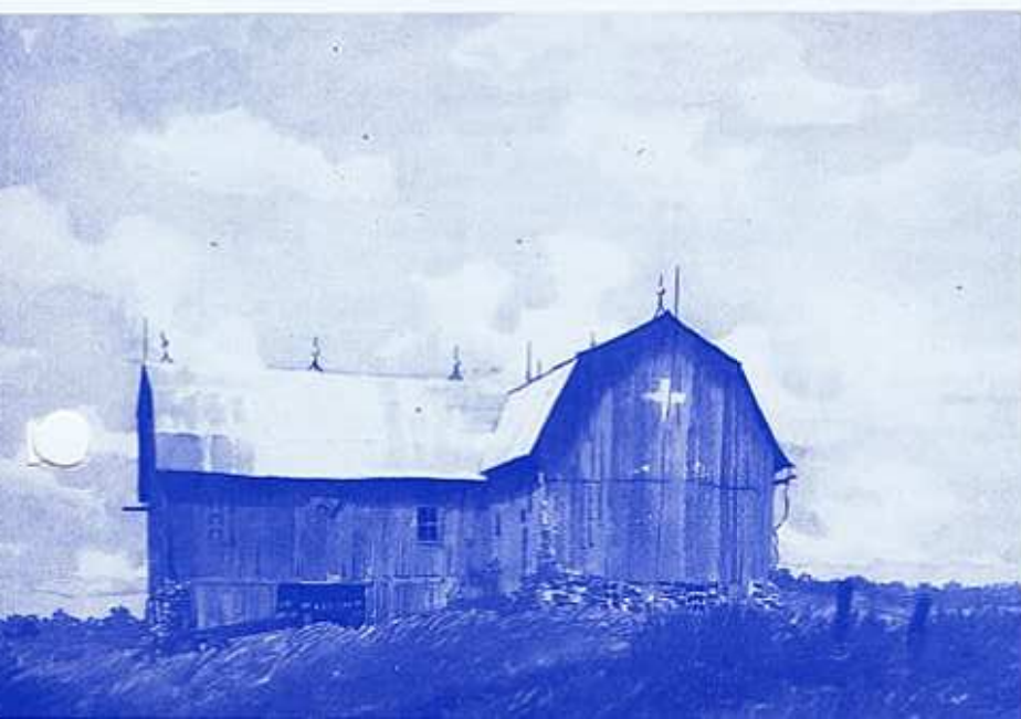
SAINT PETER'S BARN, AT MOUNT SAVIOUR Watercolor by Brother Luke Pape

THE BENEDICTINE COMMUNITY 3761 ave de Vendome Montreal, Que. Canada H4A 3M8