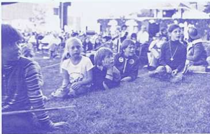
Our thanks for a successful Fall Festival. Many events fascinated the kids and interested nearly 17,000 people.