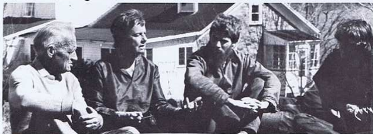
↑ Scott and Helen Nearing, authors of "Living the Good Life", were here with members of a Cornell University course in "asceticism and ecology", over an April w

"The Trees", resis of the Cathedr the Divine in visited us for March, and musical pro makes use of of kinds of to gees and other texts.