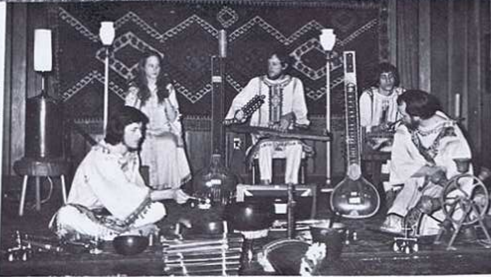
at community of St. John New York City, few days in formed their in, which multitude fragments of Psalm ritual →